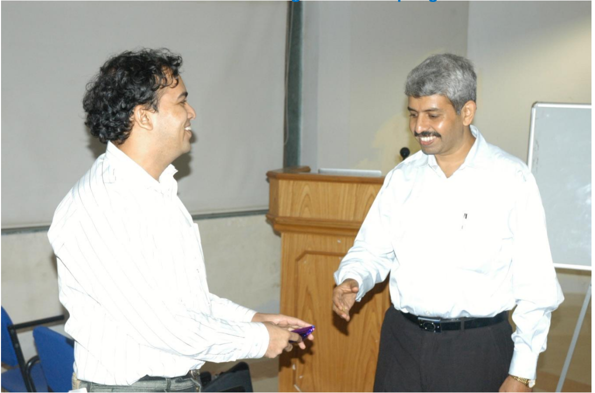
Hemant Dhamne's Special effect photo bagged 1 st Rank in Photo Contest