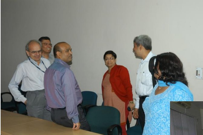
Time for update on scientific progress after leaving alma mater